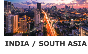
INDIA / SOUTH ASIA