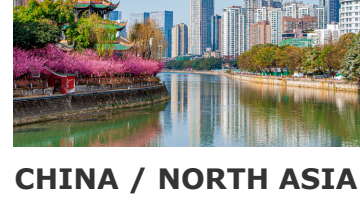
CHINA / NORTH ASIA