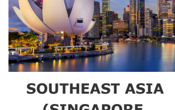
SOUTHEAST ASIA (SINGAPORE, THAILAND, VIETNAM)